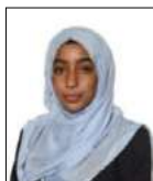
Head Girl and Head Boy